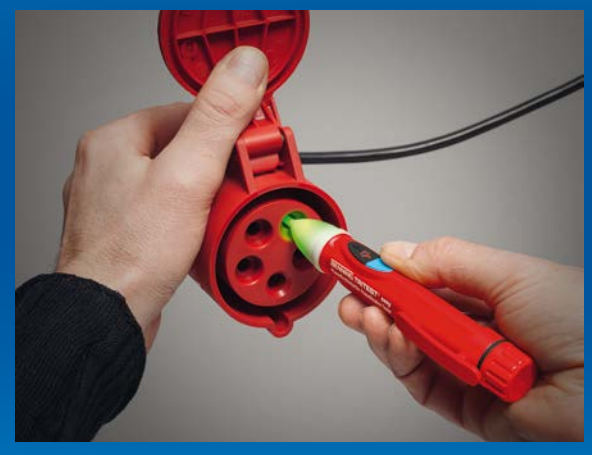
Phase sequence testing in CEE coupling with TRITEST® easy