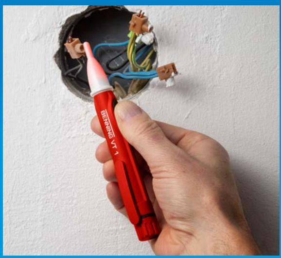
Phase test in junction boxes with BENNING VT 1