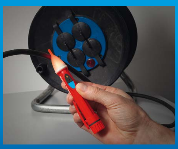
Finding cable breaks in isolated and under voltage lines with TRITEST® easy