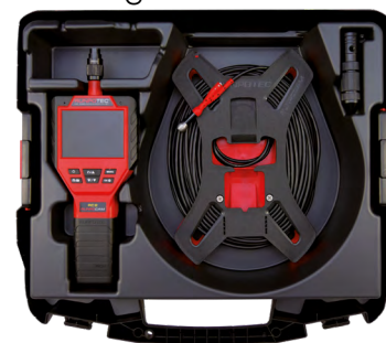
Symbolpicture - without content